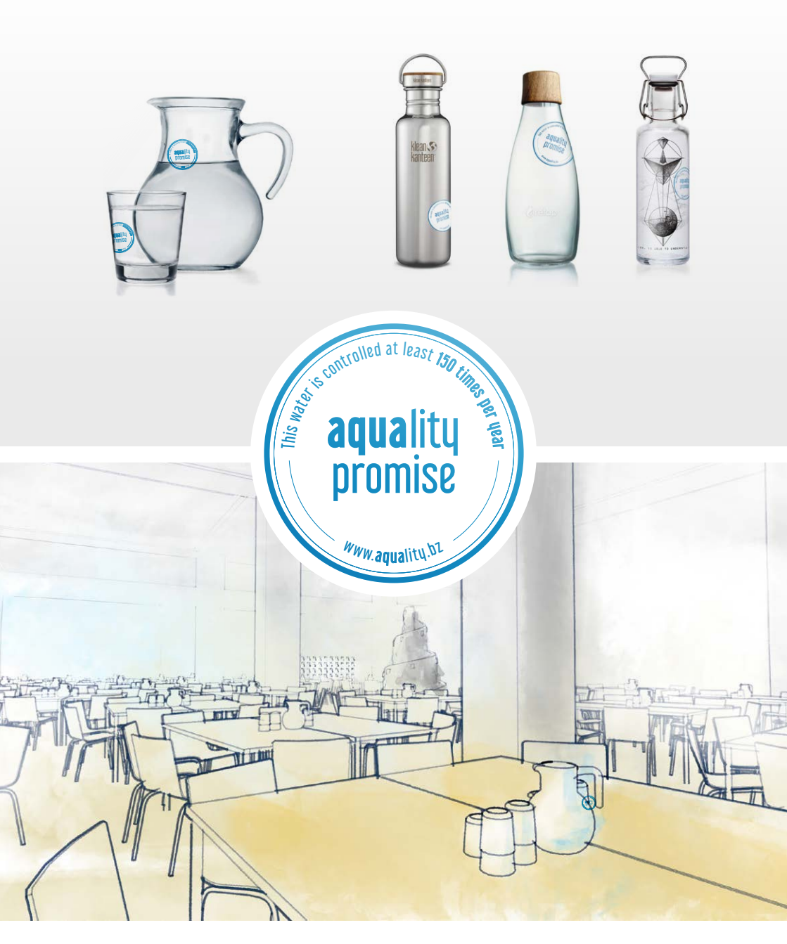
Glasses and jugs, a quality signet, group tables, a rack and a fountain are part of the new arrangement in the mensa .