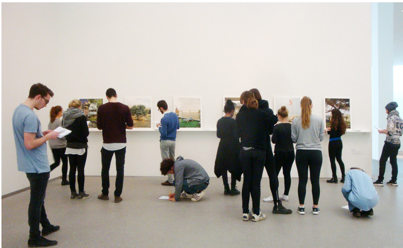
Exhibition view, Pinakothek der Moderne, 2017