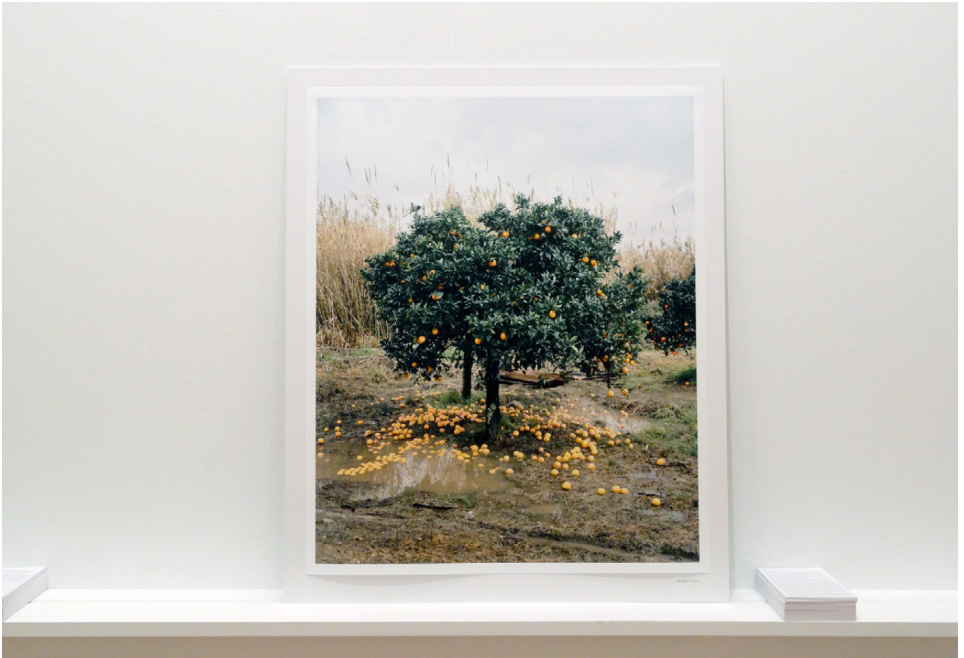
Exhibition view, Pinakothek der Moderne, 2017

Alone Together – Photography and the Other , The National Gallery of Kosovo, Pristina/KOS. With Marina Abramovic and Ulay et al. (catalogue)