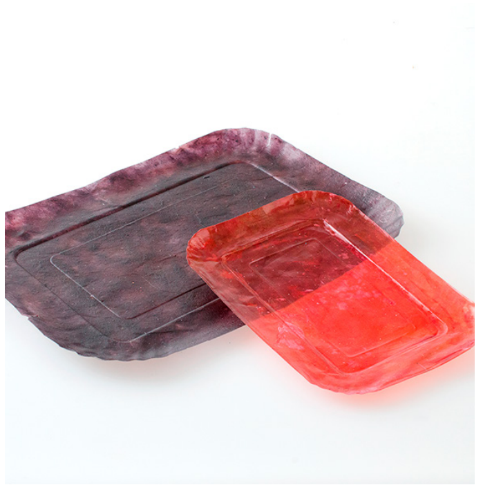
Figure 11 -14