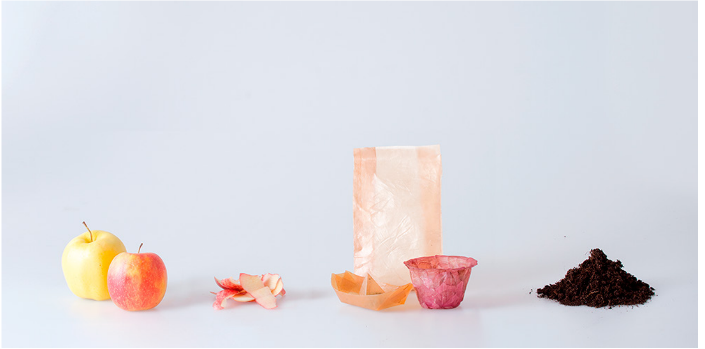
Figure 5, 6, 7