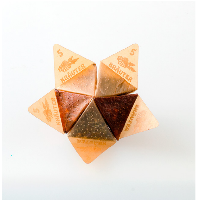
Figure 8 - 10