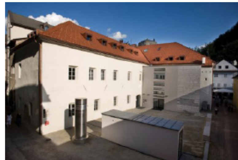
Free University of Bozen-Bolzano Campus Bruneck-Brunico