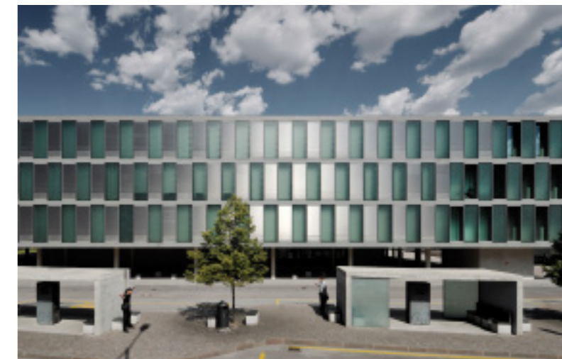
Free University of Bozen-Bolzano Campus Brixen-Bressanone