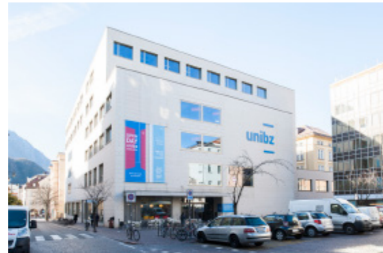
Free University of Bozen-Bolzano Campus Bozen-Bolzano

Opening hours: InfoPoint in Bozen-Bolzano (room A1.01) Monday 2 p.m. to 4 p.m. Tuesday and Thursday 10 a.m. to 12.30 p.m.