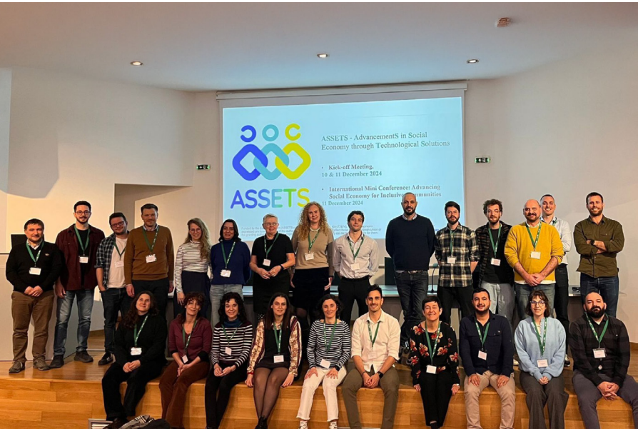
Kickoff meeting of the EU Horizon Project ASSETS in Thessaloniki [December 11–12, 2024].