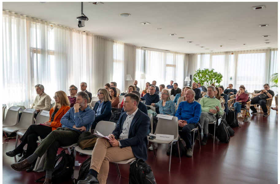
Audience at the event "Community Cooperatives: Innovation, Development, and Inclusion" (March 26, 2025).