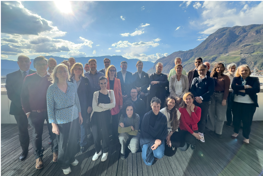
Group picture with participants at the event "Community Cooperatives" (March 26, 2025).