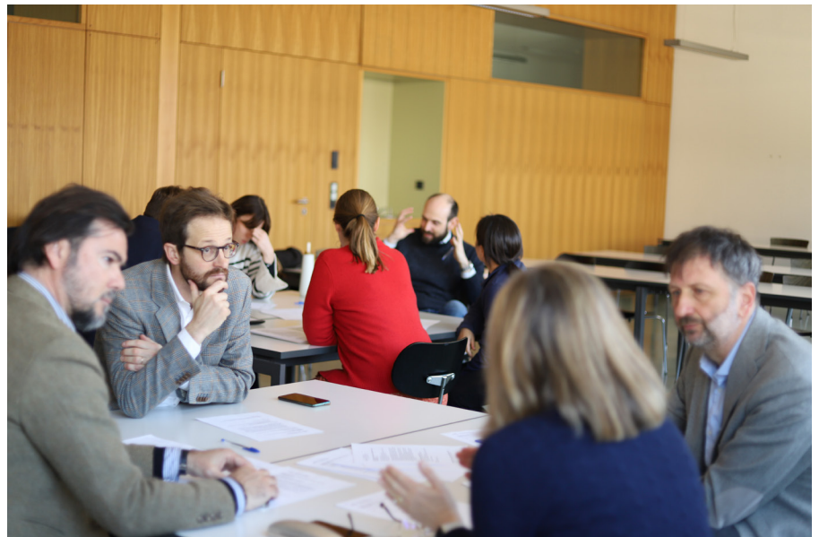
Members and stakeholders of the Competence Centre participating in the workshop, Social Business Model Clinic'.

The research focuses on both the historical and contemporary roles of cooperatives in regional socio-economic development, examining, for instance, how these organizations contribute to community growth and sustainability. It explores innovations of cooperative models, such as the emergence of community cooperatives or the role of cooperatives in the co-design of public services. Additionally, the research area includes comparative studies of cooperative sectors and aims to deepen understanding of the transformative potential of cooperatives in modern economies and societies.