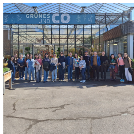
Study Excursion “COOP – Evergreen Economy” to Brunico (April 5, 2025).

This initiative not only showcased inspiring local examples but also underlined the Centre’s commitment to linking academic insight with real-world impact –empowering students to explore cooperatives as future-ready, values-driven enterprises in South-Tyrol.