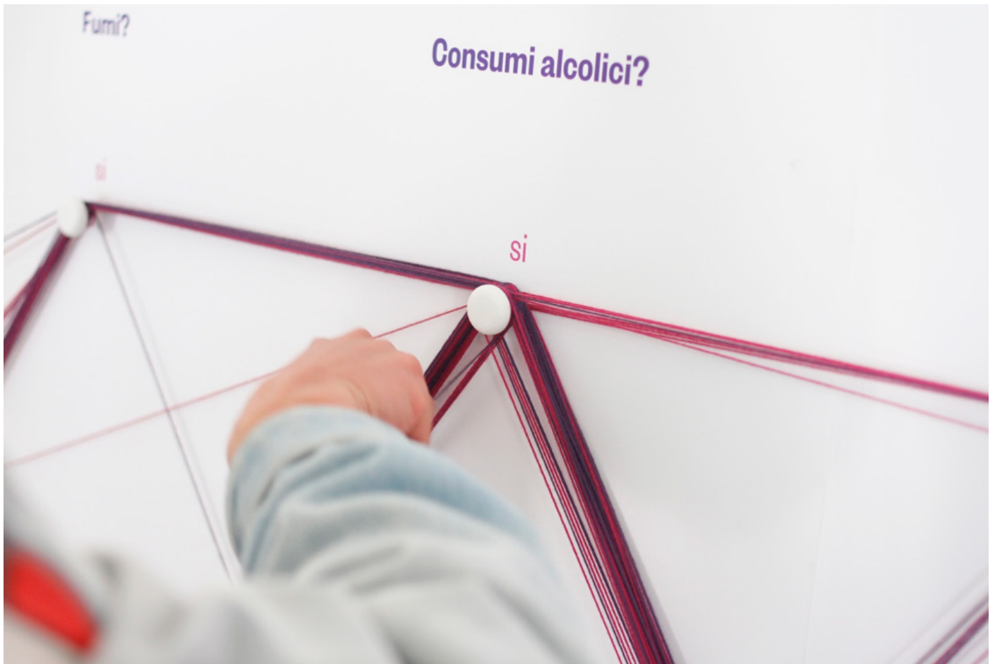
Figure 1. Detail of the first PDP case study commissioned by Know and be live and presented at the Ted Med Milan, 2017.