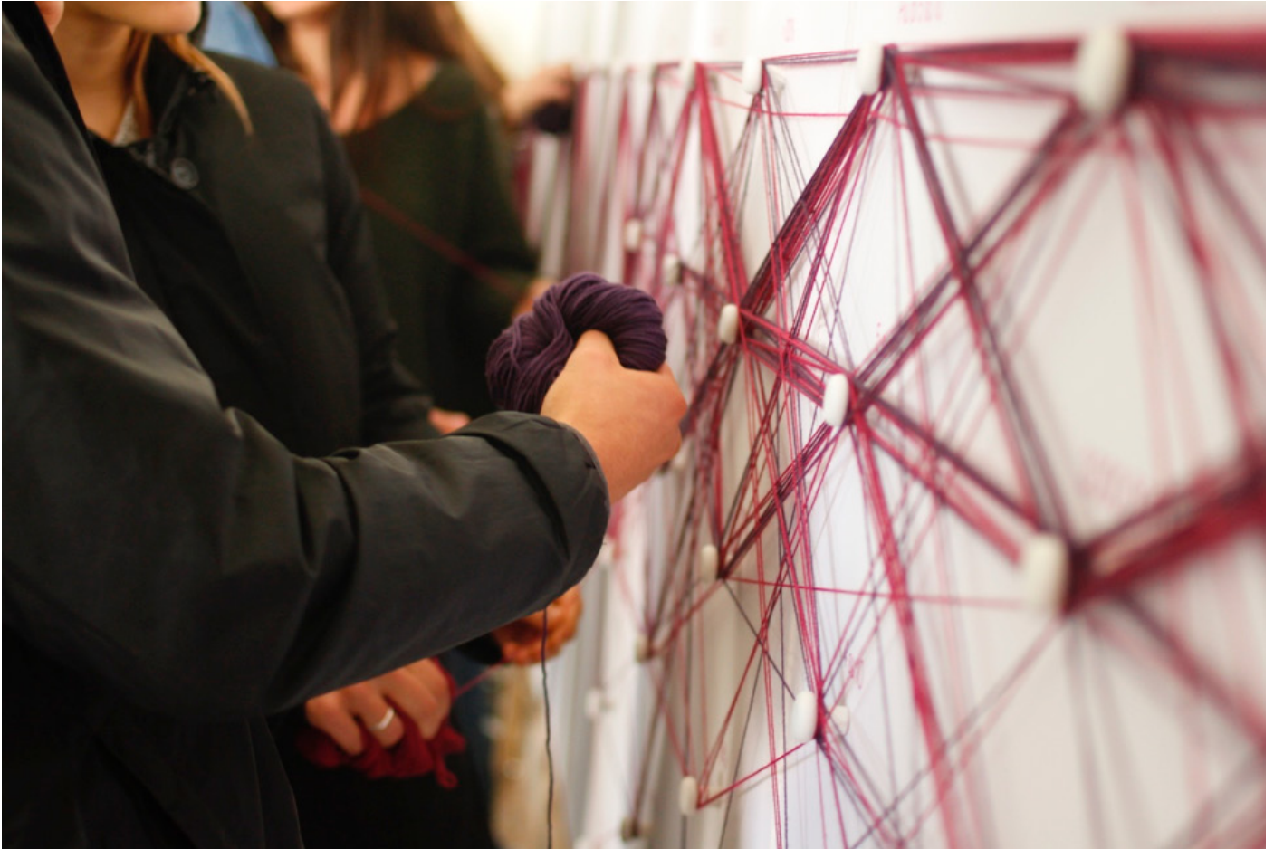
Figure 2. Detail of the first PDP case study commissioned by Know and be live and presented at the Ted Med Milan, 2017.