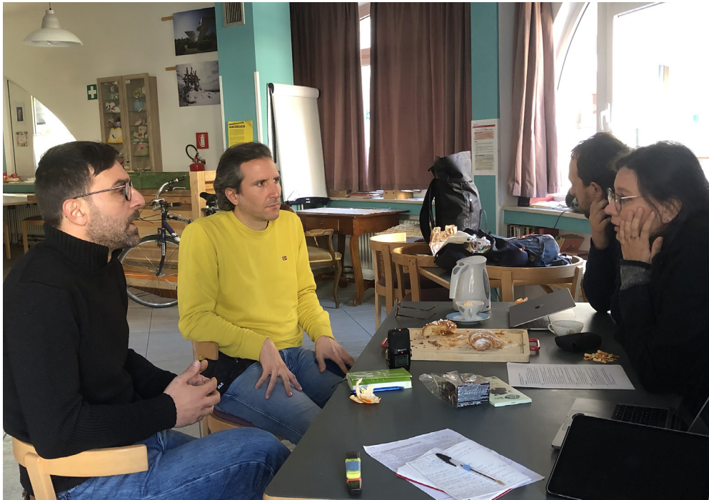
Figure 2. Interview with the local social cooperative OfficineVispa about the inter-institutional collaboration in the winter semester of 2023.

The project closely investigates the long-standing, semester-long educational module –Project 1 – of the Master in Eco-Social Design as an example of collaborative practices between Higher Education Institutions and NGO in teaching Social Design. During the module, students collaborate with the local social cooperative OfficineVispa in the co-creation of their semester projects.