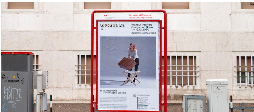
Diplorama posters around the city

The co-curation of a mixed-media exhibition in the occasion of the 2020 edition of unibz's Diplorama, the yearly exhibition of the best diploma works of the Faculty of Design and Art (December 2020)