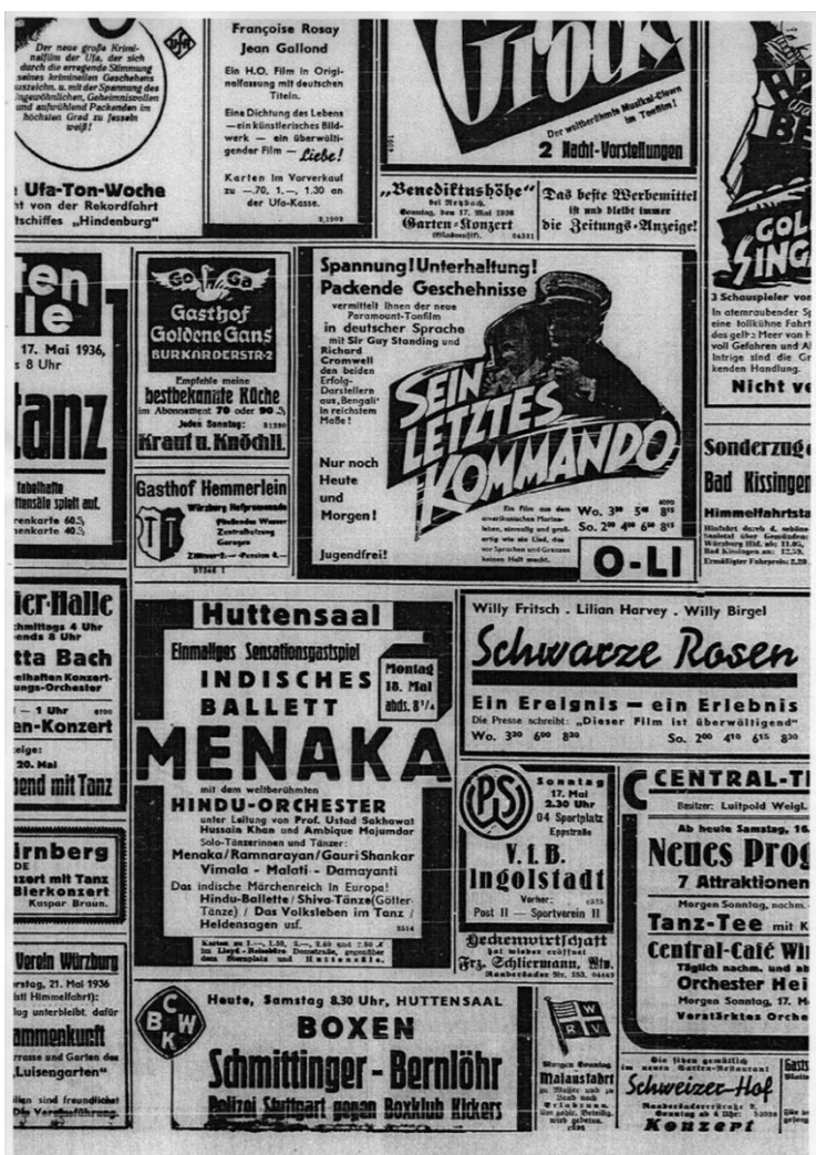
Fig. 11: Menaka announcement in the Würzburger Generalanzeiger on May 16, 1936.