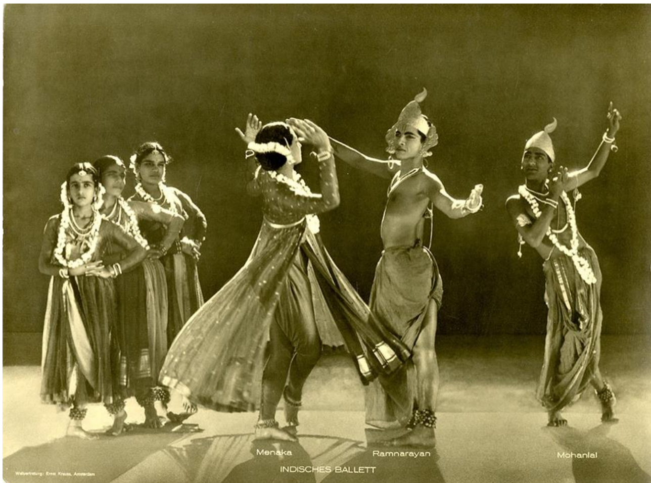
Fig. 2: The Indian Ballet

These are some of the milestones of an artist's life trajectory, which quite literally crisscrossed with conflict-ridden spaces across Europe and India – both geographically and metaphorically. Menaka's body of work is considered one of the first internationally recognized attempts at staging and establishing contemporary Indian dance. It aimed to be accepted both creatively and theoretically on a par with the Western avant-garde. At the same time, it also sought to emancipate itself from the hegemonic power of the European art world to develop an independent and "nationally authentic" artistic language.