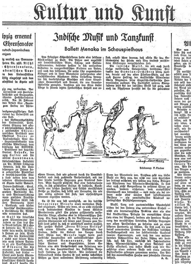
Fig. 9: Menaka review in the Leipziger Neue Zeitung of April 9, 1936.