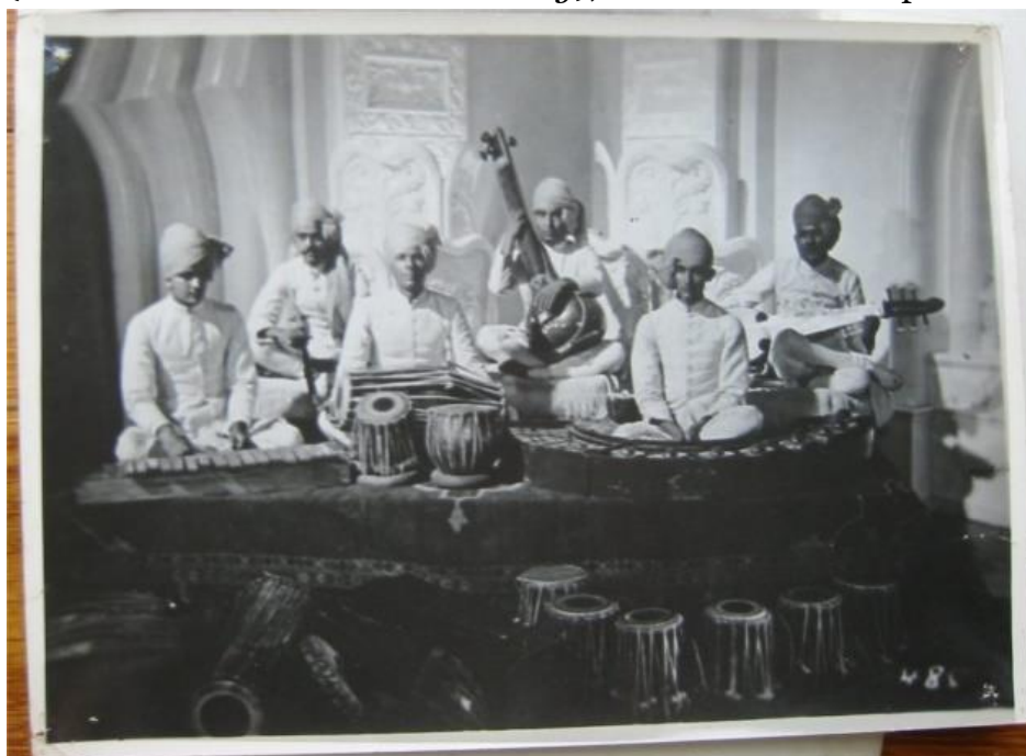
Fig. 10: The Menaka Orchestra on the film set of "The Tiger of Eschnapur", 1937

( Ian Sayer Archive ), private collections ( The Hanova Sisters' Collection ), or British secret service notes on a member of the ensemble also shed light on a global network (Kuhlmann 2003: 172).